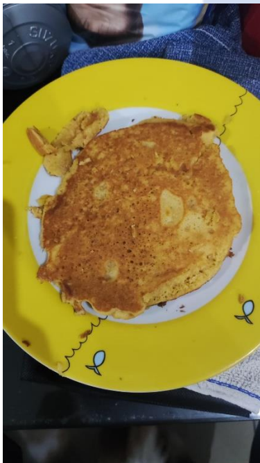
Pancake Tepung ampas tahu dengan 50% ( Produk A )