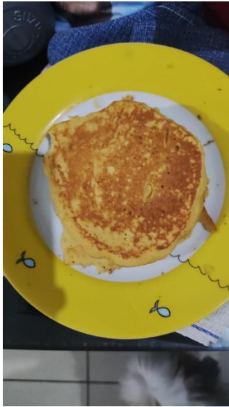
Pancake tepung ampas tahu dengan 65% ( Produk D )

Hasil Foto Uji Coba Produk A, B, C, dan D