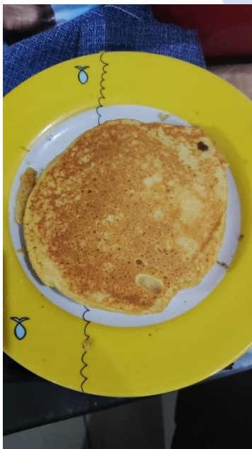
Pancake Tepung ampas tahu dengan 60% ( Produk C )