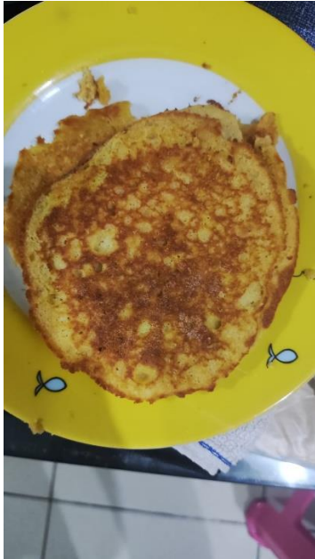
Pancake Tepung ampas tahu dengan 55% ( Produk B )