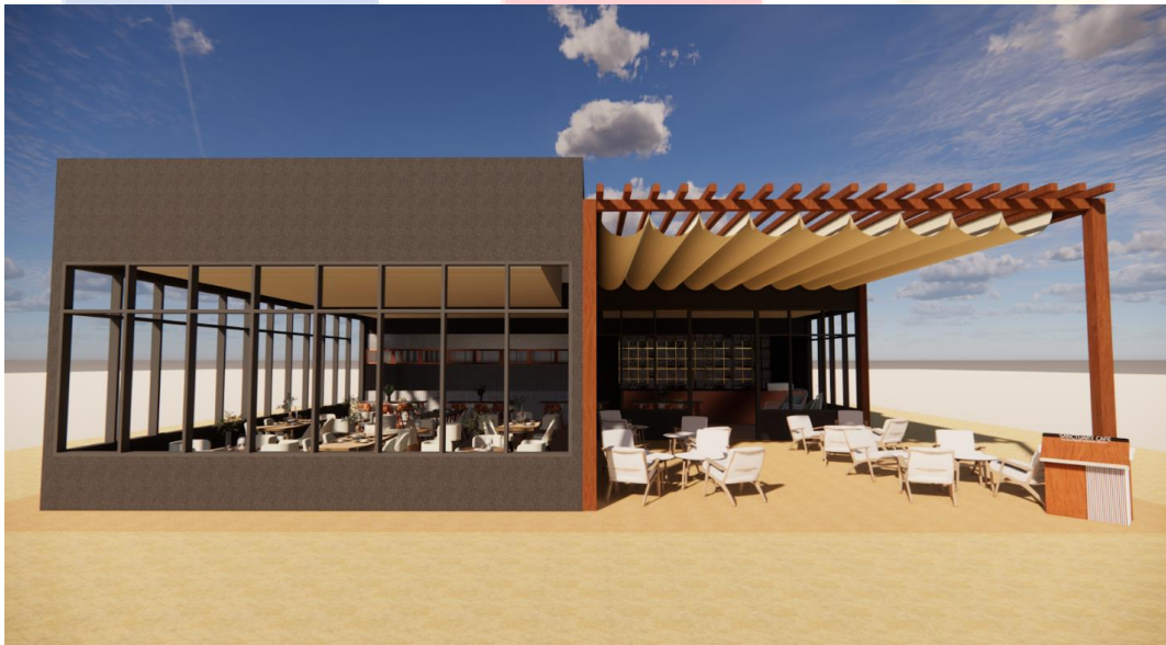
Exterior View of Sanctuary Café