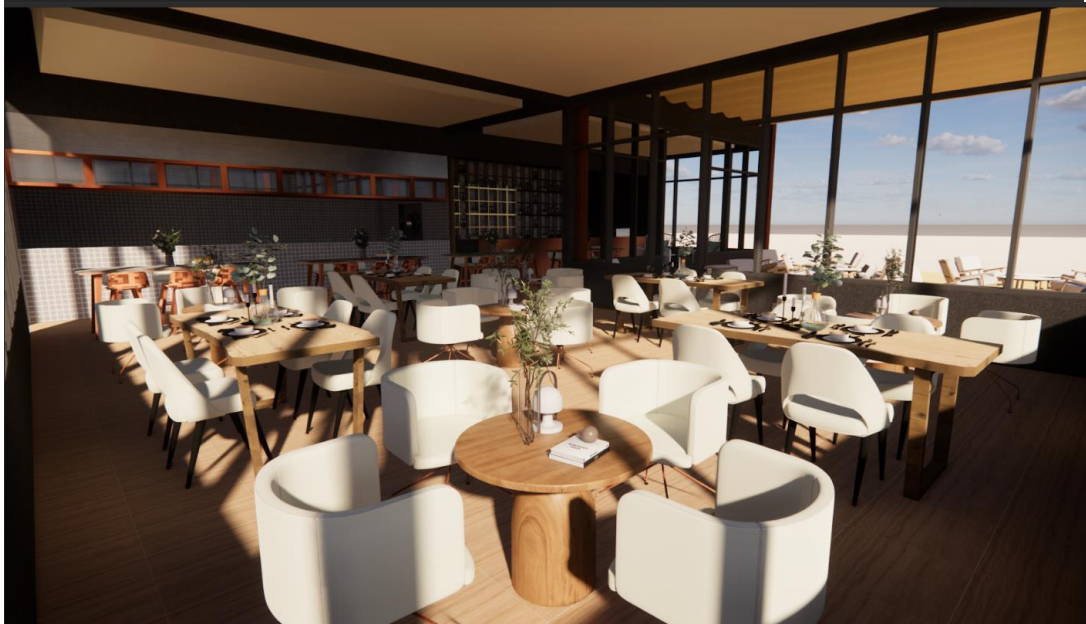
Dining area of Sanctuary Café