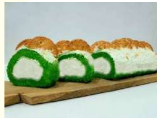
Figure 2. 3 Putu Ayu Roll Cake