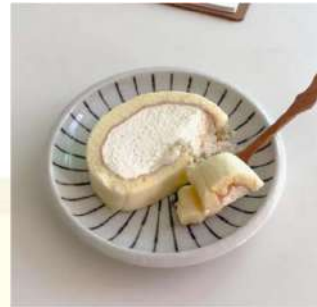
Figure 2. 7 Chicken Opor Roll Cake

Our roll cake has a size of 28 cm x 7 cm x 6 cm, there are two options of packaging, which are small and big. The small package will include one roll cake, one pouch that contains two pieces of teabag with sugar, a greeting card from us, and followed by a wooden set of utensils.