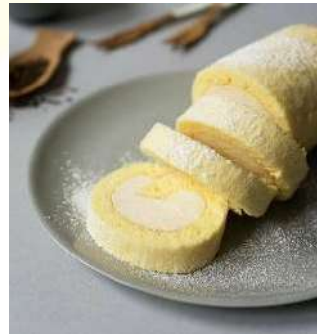
Figure 2. 4 Sesame Balls Roll Cake