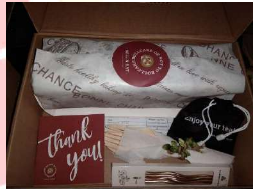
Figure 2. 8 Inside Packaging

Our roll cake has a size of 28 cm x 7 cm x 6 cm, there are two options of packaging, which are small and big. The small package will include one roll cake, one pouch that contains two pieces of teabag with sugar, a greeting card from us, and followed by a wooden set of utensils.