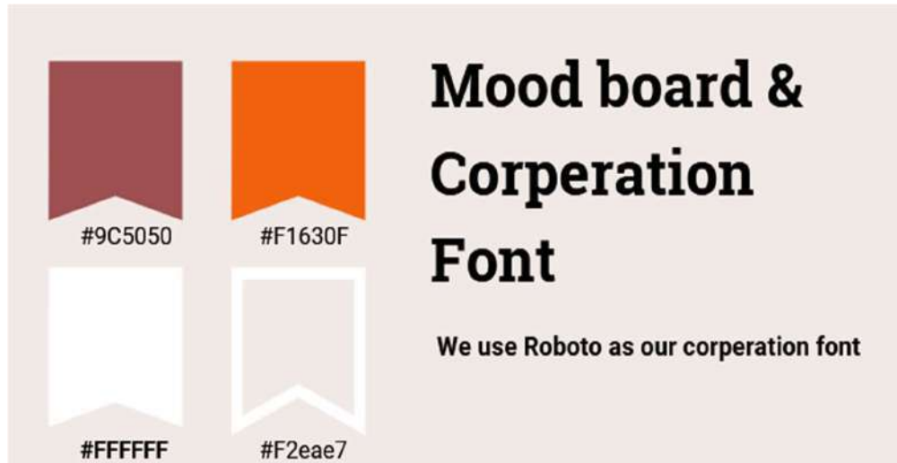
Figure 2. 10 Mood Board