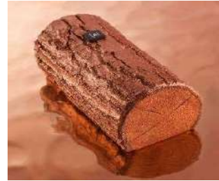
Figure 2. 6 Chicken Satay Roll Cake