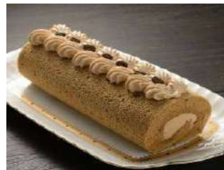
Figure 2. 5 Rendang Roll Cake