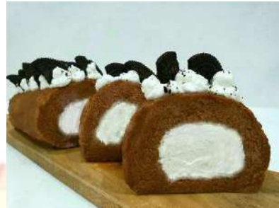
Figure 2. 2 Elephant Ear Roll Cake