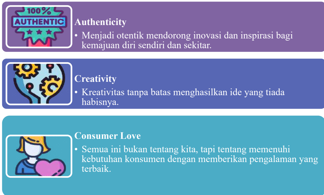
Gambar 2.5.1. Nilai Perusahaan