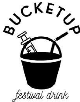
Gambar 2.5.2. Design Logo Bucket Up

Berikut merupakan logo dari perusahaan Bucket Up: