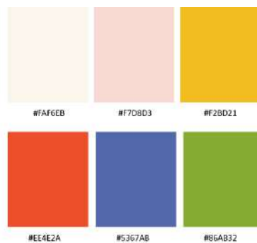
Gambar 2.5.3. Palet Warna Brand

Berikut merupakan panduan warna perusahaan yang digunakan dalam membuat asset publikasi dan promosi.