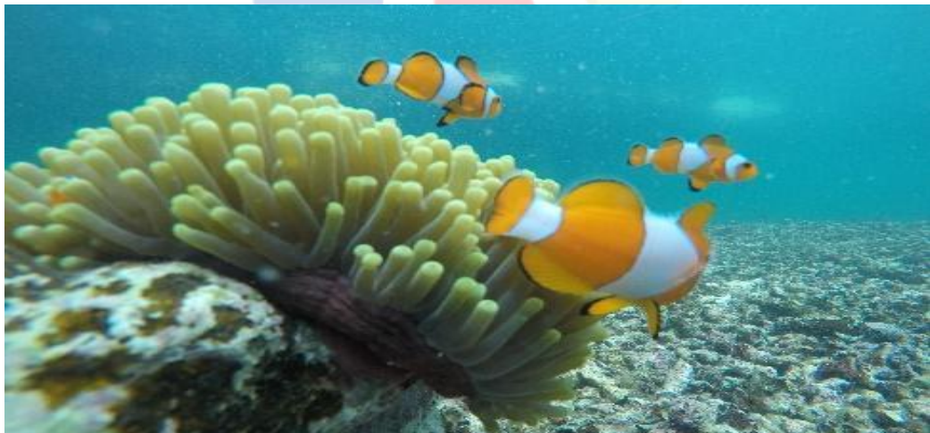
Figure 2.3.1 Visuals of Nemo