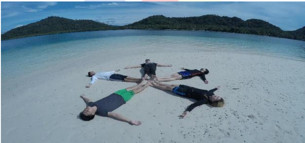
Figure 2.3.3 Visuals of Island Hopping on Kelagian Kecil Island