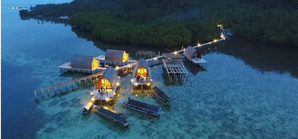
Figure 2.3.6 Andreas Cottage