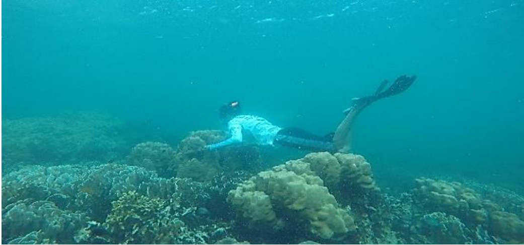
Figure 2.3.2 Visuals of Diving